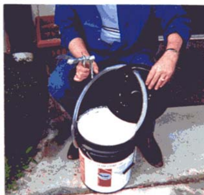
IF YOU MUST STOP SPRAYING EMPTY THE GUN AND HOSE AS INSTRUCTED AND WASH THE GUN THOROUGHLY WITH FRESH WATER.