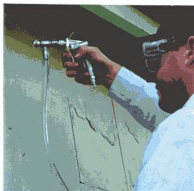
HOLDING GUN CLOSER TO THE SURFACE WILL PRODUCE A SMALLER PATTERN *