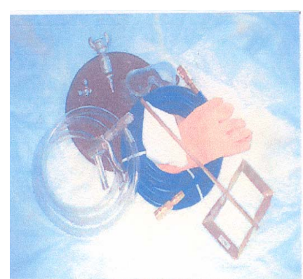
IT'S SO EASY - YOU GET THE PICTURE PICTURED ABOVE THE QUIK-GUN INDUSTRIAL KIT

ALWAYS USE PROPER EYE AND BREATHING PROTECTION WHEN USING ANY SPRAY PRODUCT.