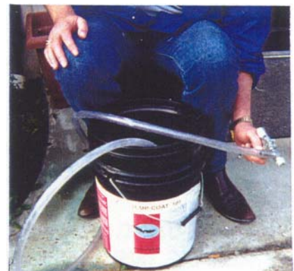
LOAD THE HOSE HOLDING THE QUIK GUN AT BUCKET LEVEL