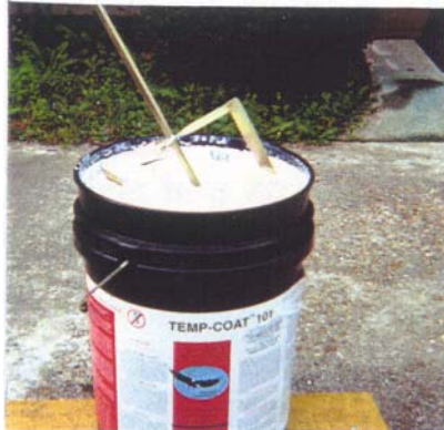
MIX THE PRODUCT FOLLOWING THE SIMPLE INSTRUCTIONS