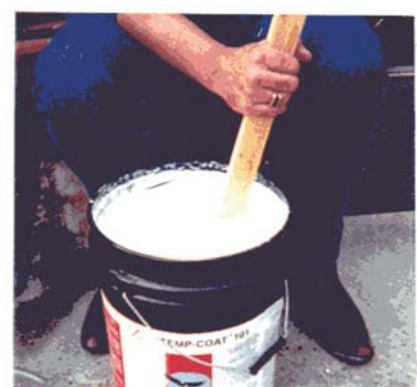
KEEP TEMP-COAT® MIXED AS YOU SPRAY BY STIRRING WITH A FLAT STICK OR PADDLE