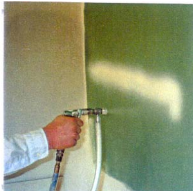
HOLDING THE QUIK GUN 14" FROM THE SURFACE TO BE COATED WILL PRODUCE A 4" TO 5" PATTERN