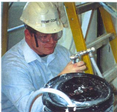
KEEP THE GUN WITHIN 4' OF THE TEMP-COAT® BUCKET TO ASSURE PROPER PRODUCT APPLICATION .