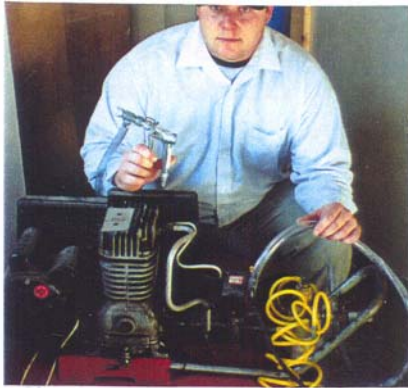
A SMALL COMPRESSOR AND THE QUIK GUN DOES THE JOB @ 80 PSI*

QUIK GUN w//Pick-up Hose. Sugg. Retail $75.00 plus $5.25 S/H